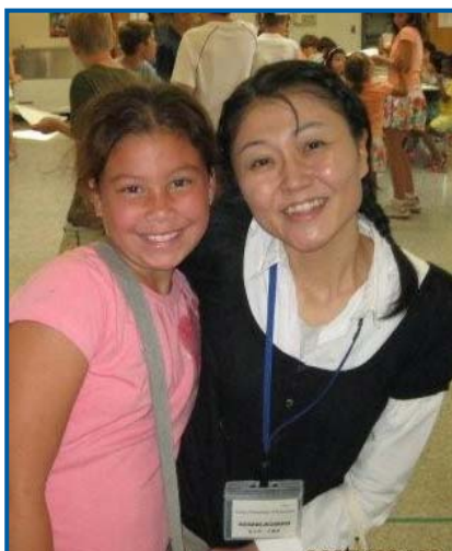
A Japanese visitor makes a new friend at a visit to a local school

During their time in Iowa, the Fellows met with elected women leaders and visited the party headquarters of both major political parties. On election day, they observed polling places and joined canvassers in Iowa City and Cedar Rapids to watch the legwork of democracy in action.