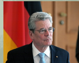
German President Joachim Gauck