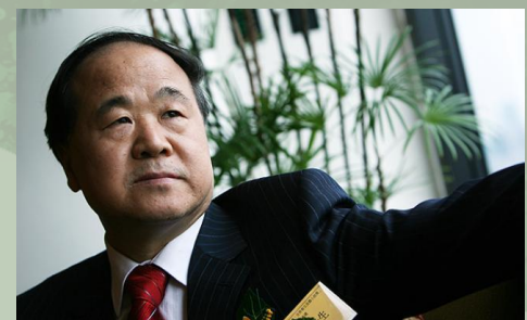
Chinese Author Mo Yan