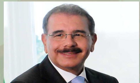
Dominican Republican President Danilo Medina