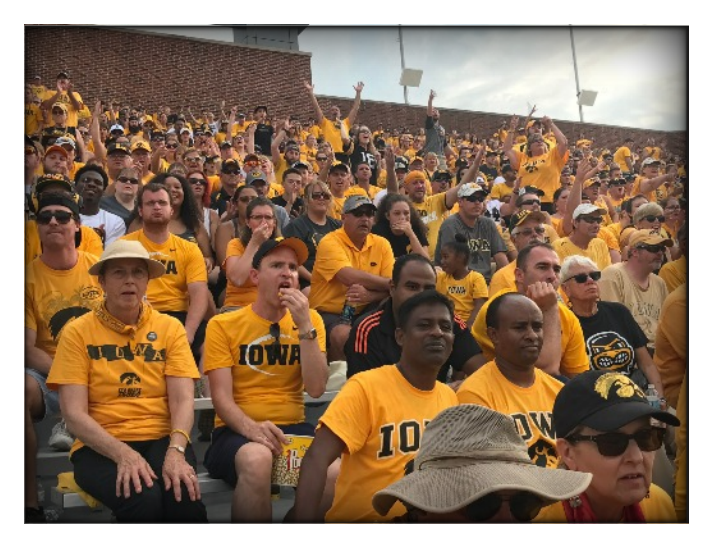
Visitors becoming Iowa Hawkeye fans