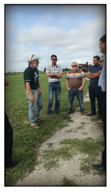
Expanding Agricultural Market Visitors from West Bank learn about and tour through Grow: Johnson County

Science and Technology Education for Youth Delegation