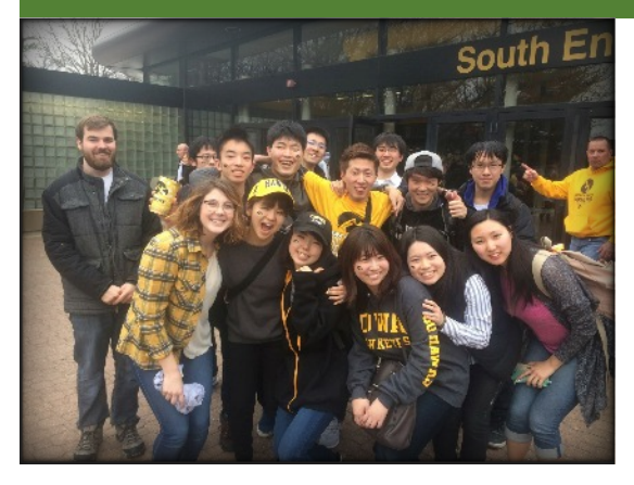
Japanese Delegation with CIVIC interns at Carver Hawkeye Arena

"This program was the strongest segment of (our) trip. Something (we) did not expect. Please extend our appreciation to your army of volunteers, hosts and drivers. They were crucial. We loved lowa."