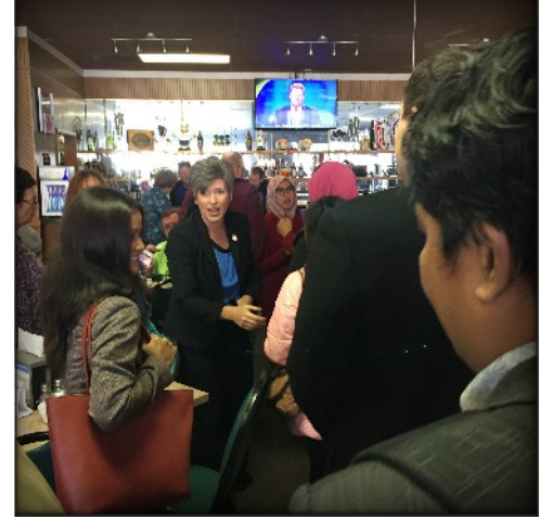
Visitors from Indonesia for Political Activism meet Senator Joni Ernst