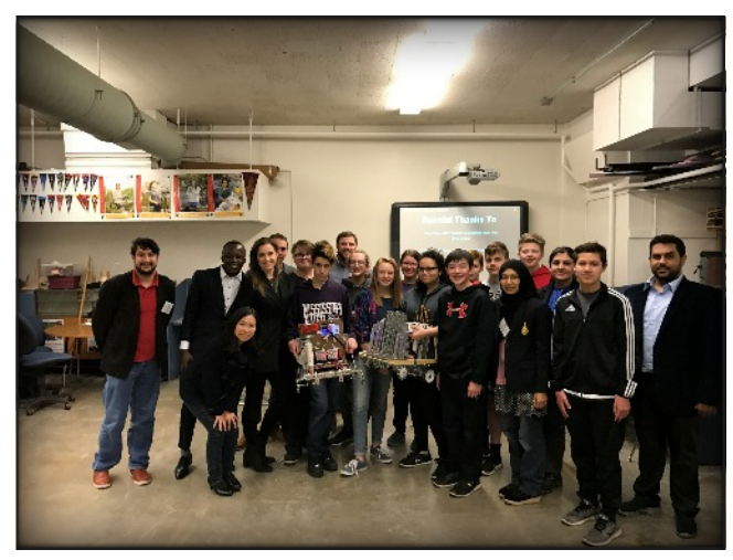
STEM education delegation meet with Cedar Rapids McKinley's Robotics Club