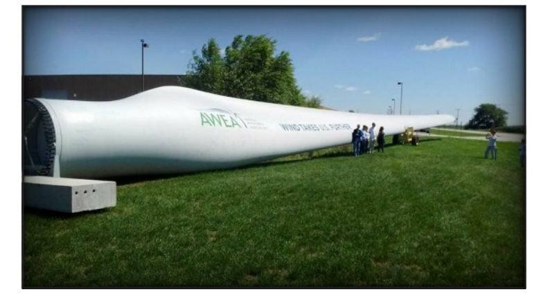
At TPI in Williamsburg with the Clean Energy Delegation

One of the European Farm to Market visitors gets a first hand look at a John Deere tractor